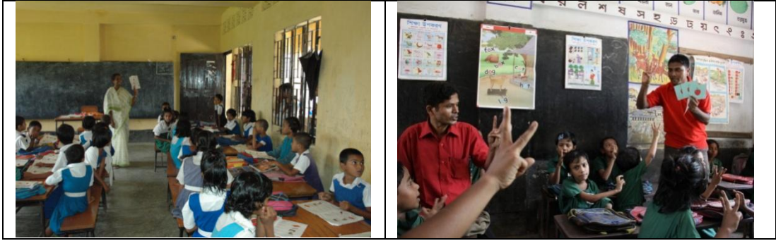
Change: engaging all the senses to learn through visual and audio resources