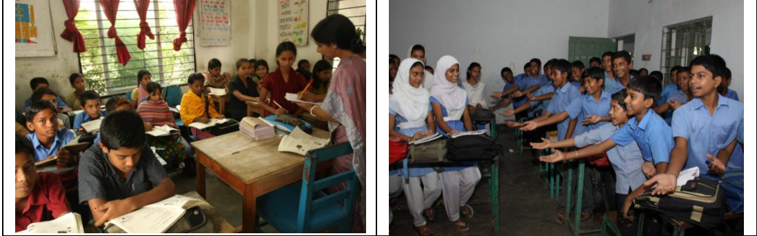
Change: practising language in context - English really means something now