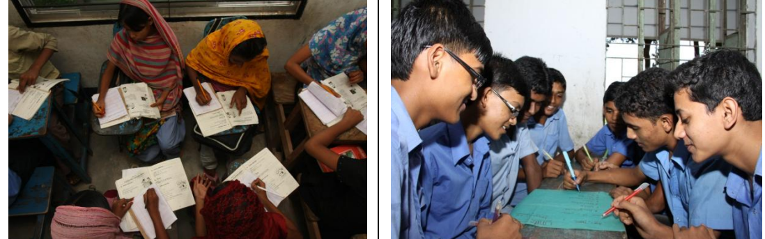
Change: students in groups now actively sharing to learn