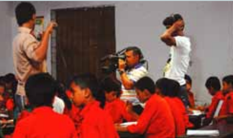
Shooting takes place in primary school in Dumuria

The video clips form an absolutely central plank of the new materials and will be a great help to