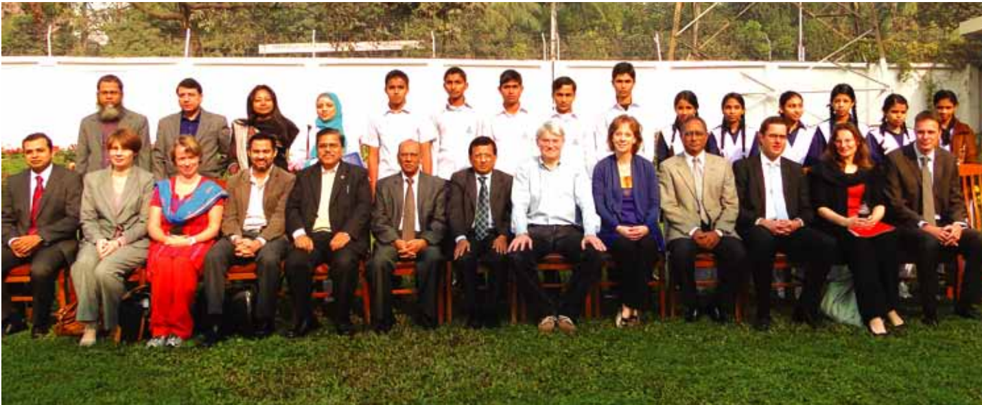
Mr. Andrew Mitchell, UK Secretary of State for International Development (in the middle), during his visit to a UCEP School in Dhaka with team of English in Action, DFID Bangladesh and UCEP.