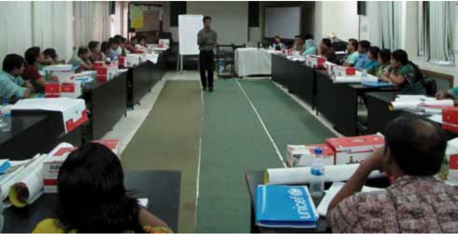
EIA orientation programme for teachers under Ability Based Learning (ABL) project- UNICEF

UNICEF works in the field of non-formal education with approx. 200,000 working children, targeting those aged 10-14 years in urban areas. UNICEF is planning to align their materials to the national curriculum and to work in the following subjects: Bangla, English, Maths, Life Skills. As first step towards this, UNICEF have conducted a gap analysis and developed a competency framework based on the national framework.