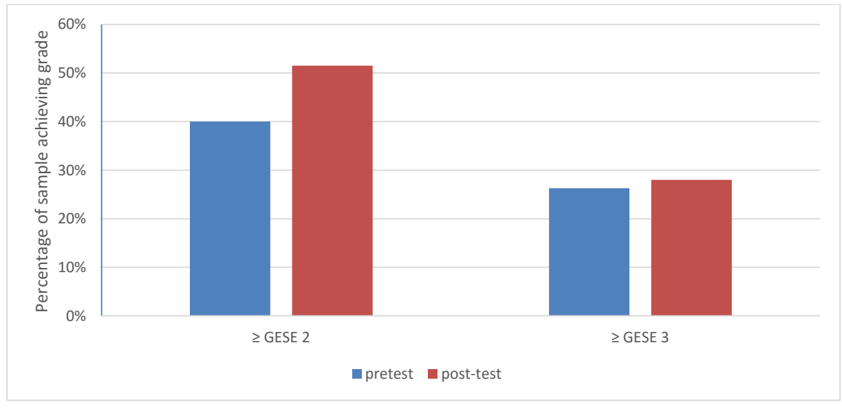
The logframe also contains targets for improvements (over the baseline) in each phase to be achieved in 2017 against these two criteria.

Table 14 indicates the actual improvements compared to the targets in the logframe. This shows that at the lower grade criteria, primary achievement is 14% points above target and secondary achievement is 2% points above target; at the higher grade criteria the EIA intervention showed 2% points improvement in primary and in secondary, but both phases were 3% points below the targets. This indicates that, as has been apparent over the years of the cohort studies, EIA does better in improving students at the lower grades. However, given outcome targets were for achievement at the end of the treatment , but due to nationwide protests schools were only halfway